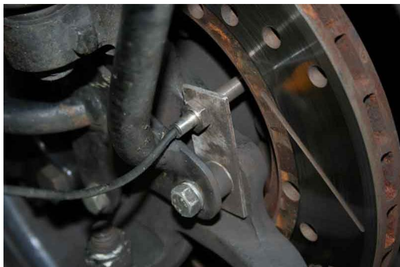
Sensor mounted on brake disc