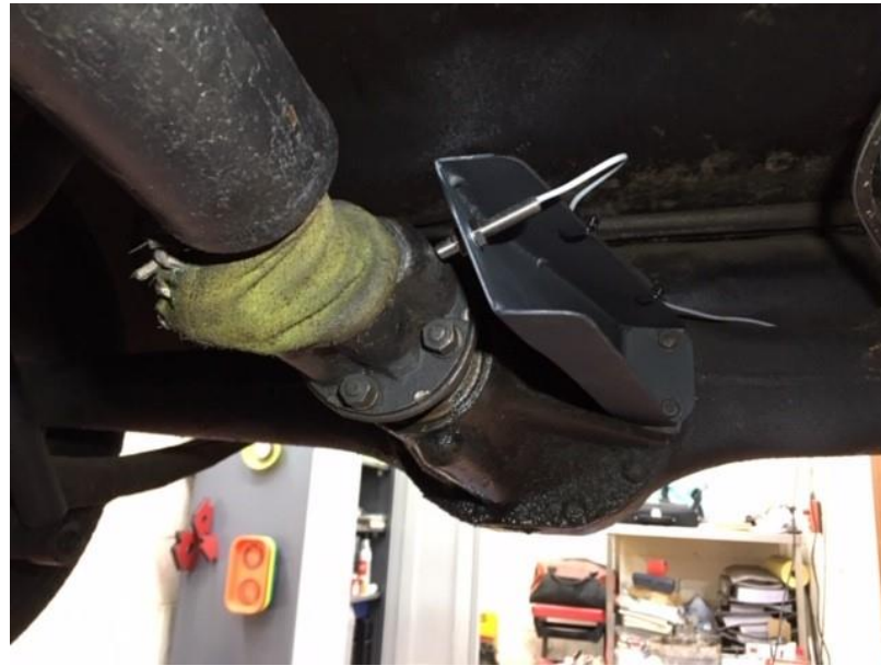
Sensor mounted on Prop shaft

The target can be any ferrous metal (e.g. a bolt head) on the drive/prop shaft that will change speed with the vehicle. See example installation pictures below: